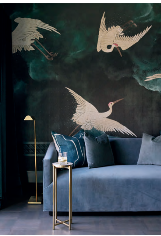
Clockwise from top: The completely reconfigured, spa-like master bath, which Wirth describes as "immensely luxurious," features beautiful French fittings, gorgeous marble, and decadent Cristallo Rosa Quartzite marble casing surrounding two symmetrically placed vanity mirrors. The wine room's ultra-chic kitchen exhibits Verde marble countertops, open brass shelving, and custom cabinetry and trim in Farrow & Ball's Carriage Green. In the office, Phillip Jeffries' Flight wallcovering sparks conversation during Zoom meetings. An RH sofa in a soft blue enhances the design.

"Between wallpapers and fabrics, I don't think I have ever sourced as much with a client" says Wirth. "She has such a refined taste – so textures, colors, patterns, and subtle juxtapositions are very important to her." Each room in the home satisfies a different mood yet flows seamlessly into the other, unified by the details and marked by a cohesive sense of color and culture.