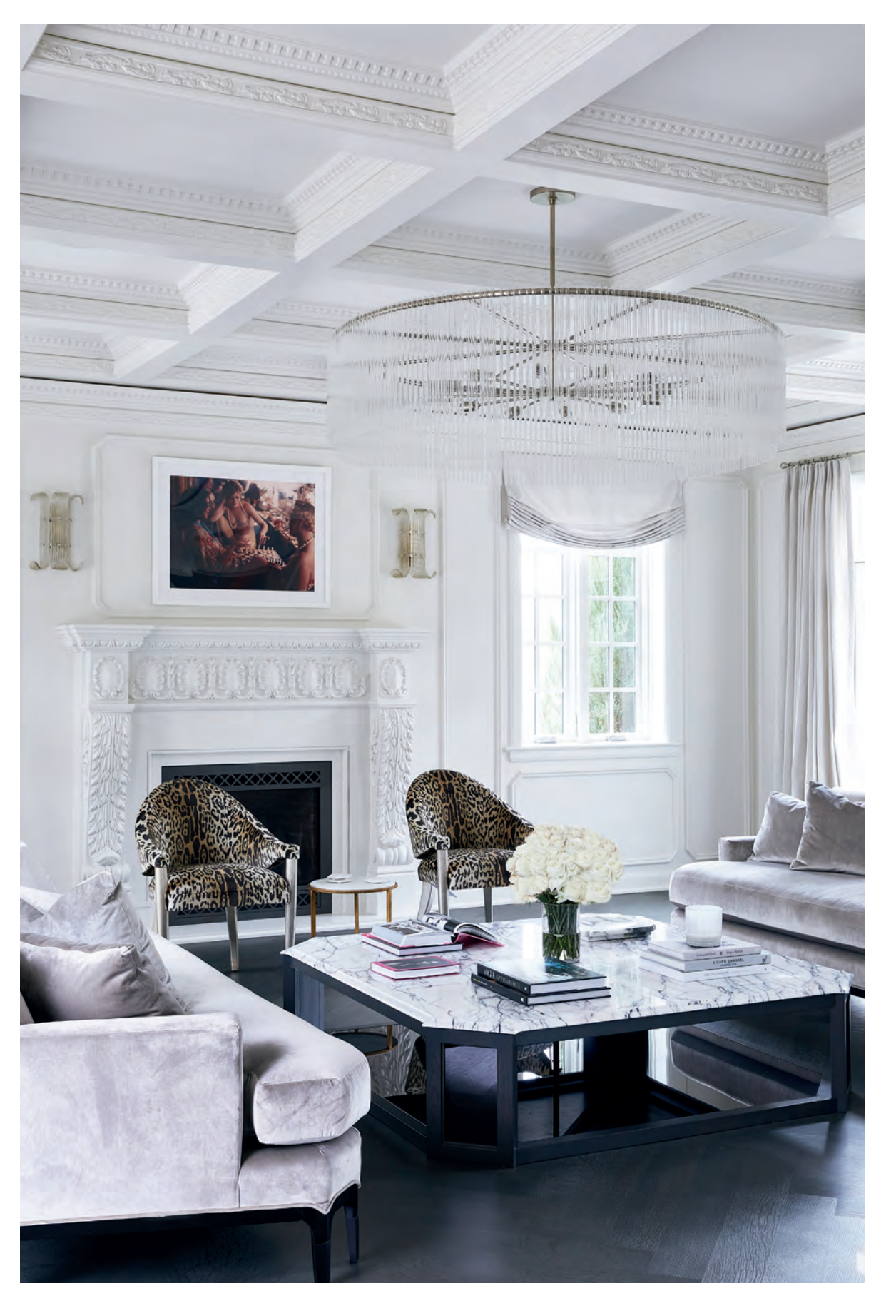
Leopard chairs in a Nobilis fabric add a lively, unexpected jolt to the serene, effortlessly elegant living room.